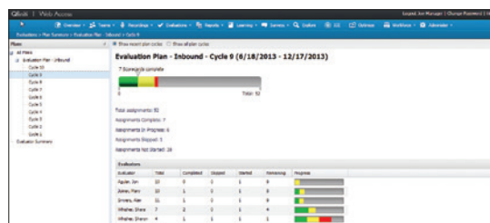
Plan administrators can easily monitor completion of evaluation work within the comprehensive Qfiniti Advise evaluator assignments dashboard.